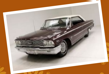
This 1963 Ford Galaxie 500 recently sold for $22,900