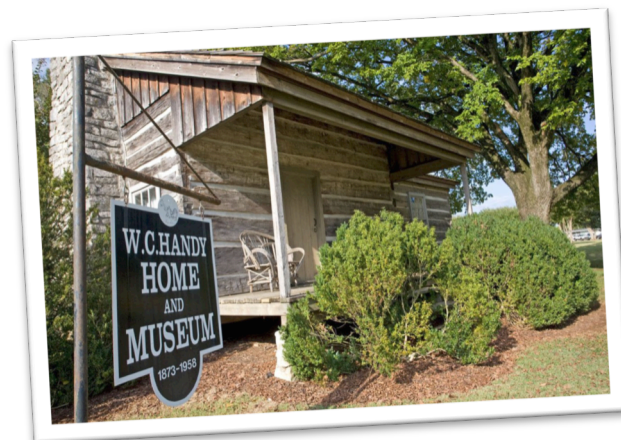
W. C. Handy Birthplace Museum