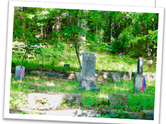
Images: (l to r) mining the stone, construction of Ross Bridge Culvert and the Parkwood Cemetery