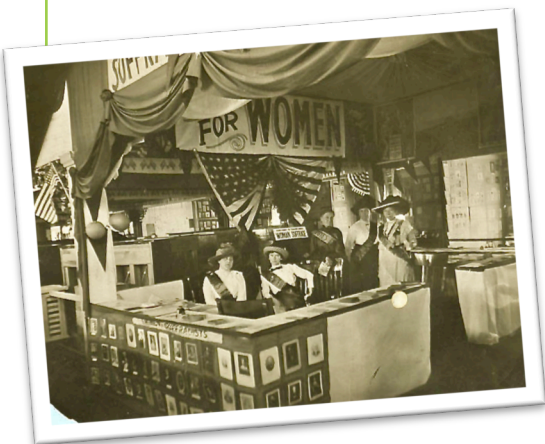
Suffragists at the Birmingham State Fair, 1914