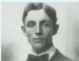
The Caldwell Family