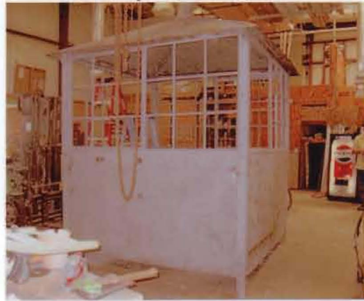
The Fire Tower cab under renovation.