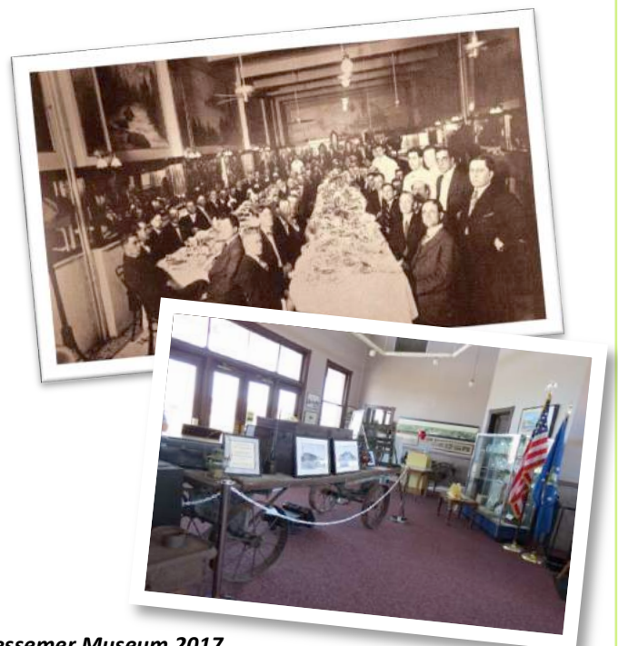
Bright Star guests in 1907; Bessemer Museum 2017