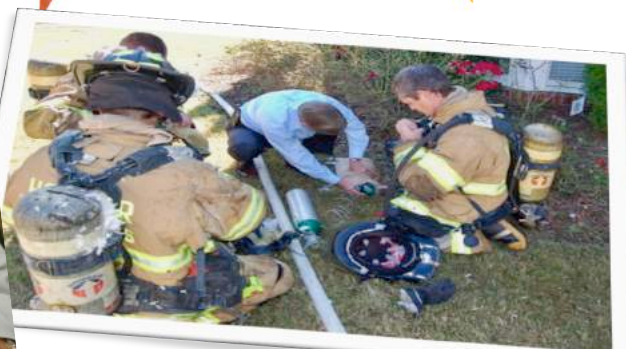
Humans and pets benefit from HFD's paramedic services.