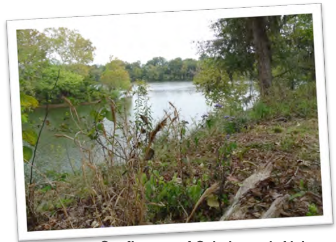
Confluence of Cahaba and Alabama Rivers at Old Cahawba

If you want to visit Old Cahawba, visit the Web site at www.cahawba.org . The visitors' center will provide information, maps, and tours to enhance your visit.