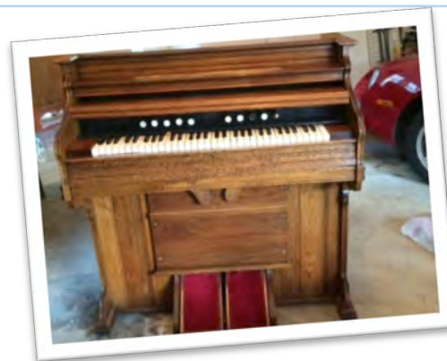
Recent donations to the Archives include a typewriter, a pipe organ, and assorted books and memorabilia from Berry High School.