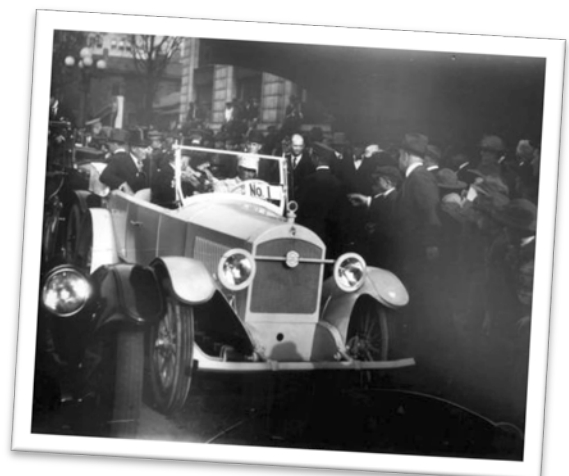
President Harding in the Premocar in 1921

His love of history and genealogy has resulted in numerous publications. An avid postcard collector, he has over 60,000 in his personal collection. He also collects old books, maps, and any type of memorabilia that you can imagine. He belongs to many historical and genealogical societies, and numerous other organizations. He currently has over 35,000 names in his genealogy database.