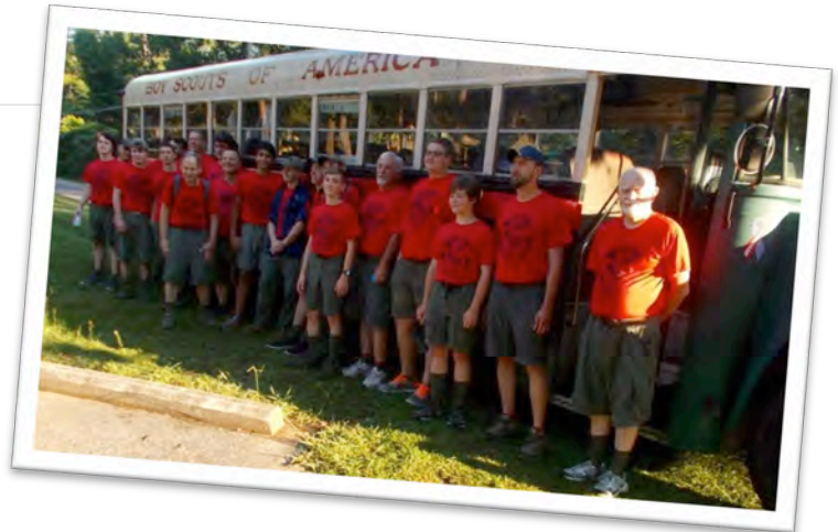
Some of the members and leaders of Boy Scout Troop 21 prepare for their High Venture Trip to Philmont Scout Ranch in New Mexico in the summer of 2016.