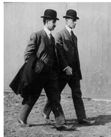
The Wright Brothers in 1910

Refreshments will be served from 2-2:30 PM, with the program at 2:30 with a short business meeting to follow. Please join us at the Hoover Public Library (across the hall from the Library Theater) for this enlightening program. No reservations required, free parking! See you there!